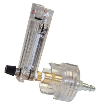
Total Particulate Test Module LP-47PF