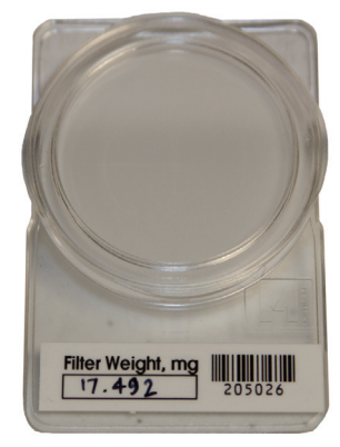
47 mm Filter Pre-weighted MW-47